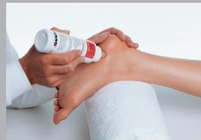
3. Applying the contact gel