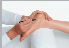
2. Marking the treatment area