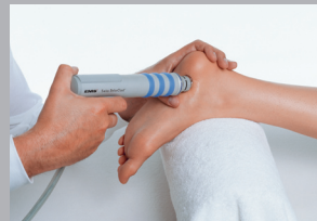
4. Delivering the shockwaves