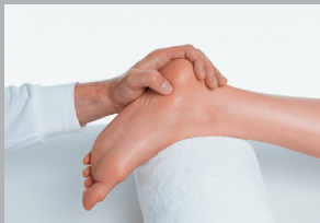
1. Locating pain area by palpation

A typical session lasts about 15 minutes. You will require three sessions, each between one and two weeks apart.